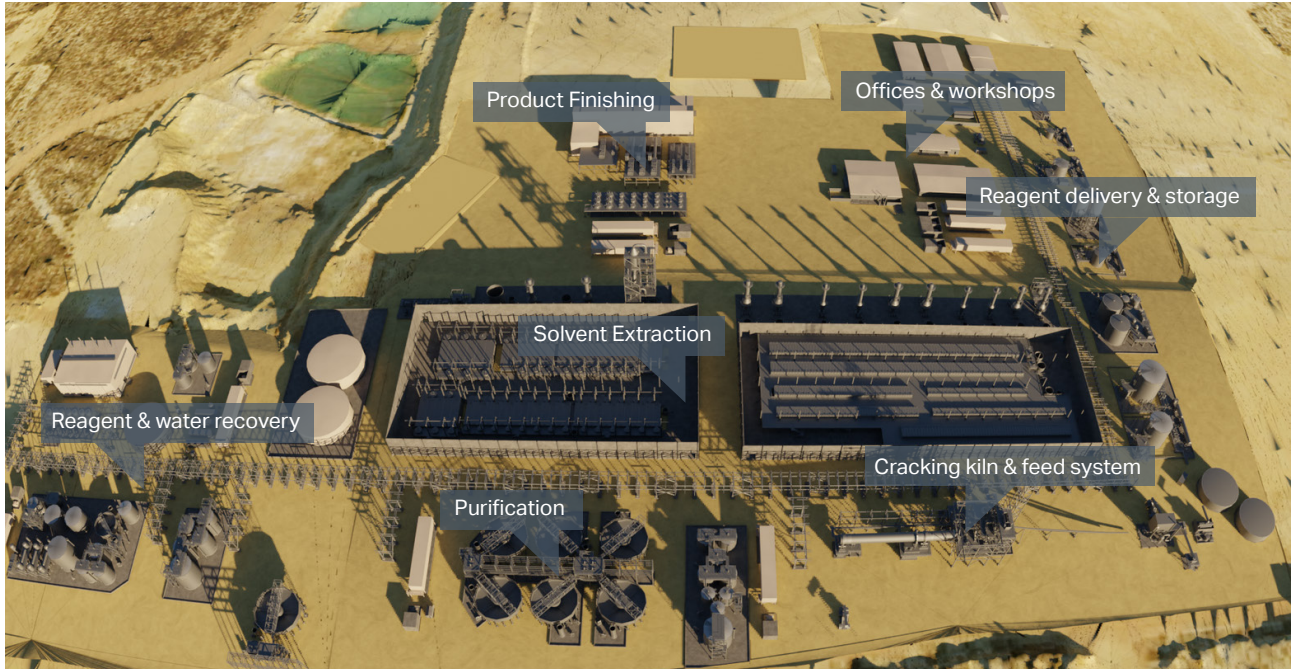
Eneabba Rare Earth Refinery Layout.