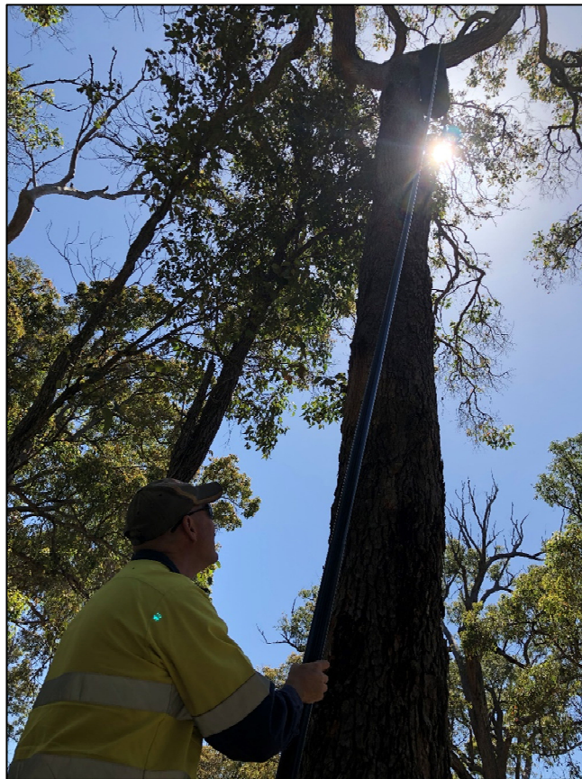
Plate 3: Inspection of artificial nest hollow