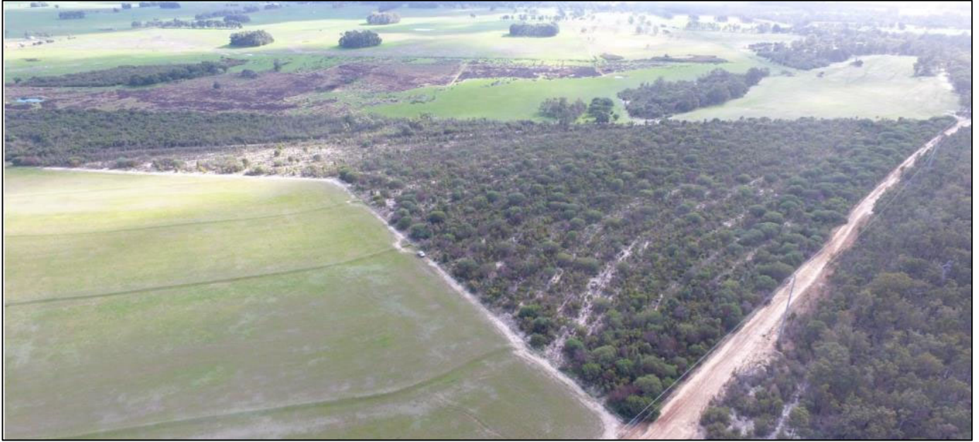
Plate 2: Roberts Block and Vegetation Link May 2020