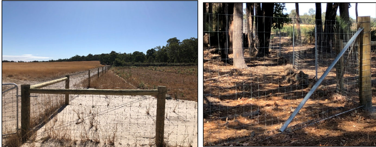
Plate 4: Internal Stock Fence (left) and 1.5m Boundary Fence (right)