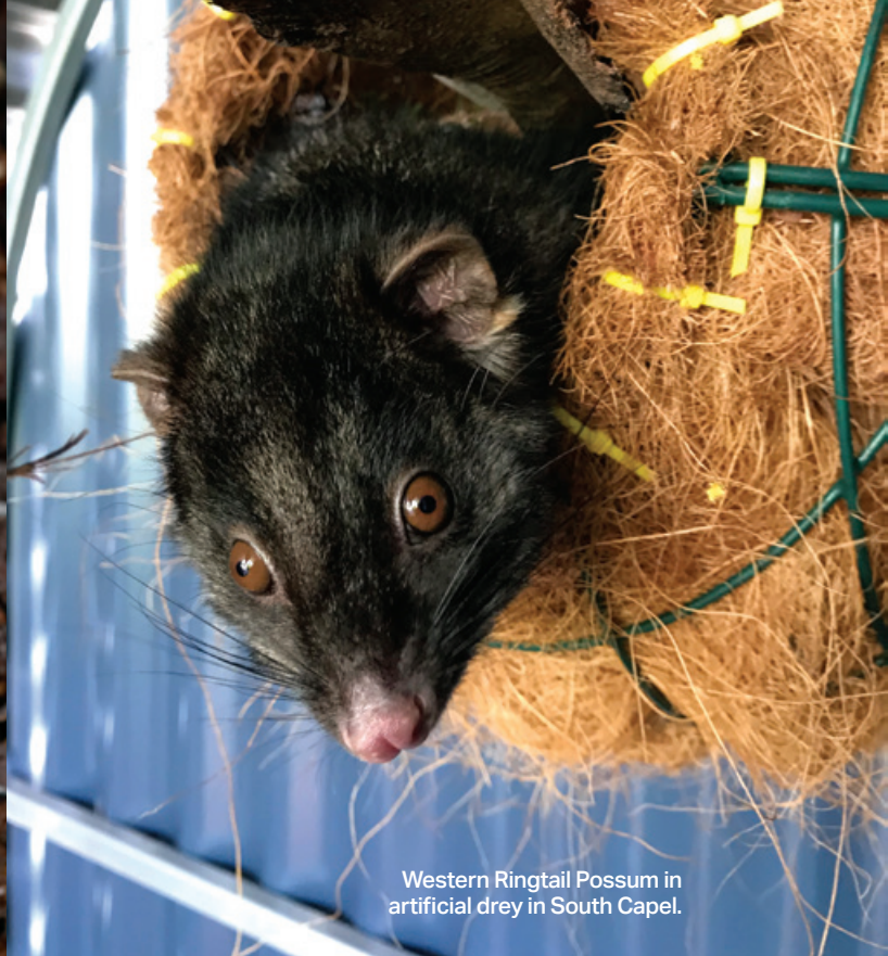
Western Ringtail Possum in artificial drey in South Capel.