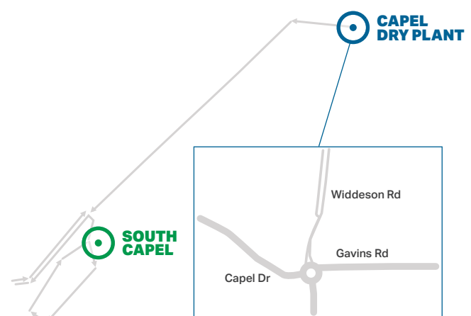
Fig 1: Proposed Haulage route between CDP and SC

Iluka will continue to monitor the groundwater for improvements such as reductions in the levels of contaminants detected, and in the overall size of affected areas. Iluka expects monitoring will continue for the next 10 to 20 years.