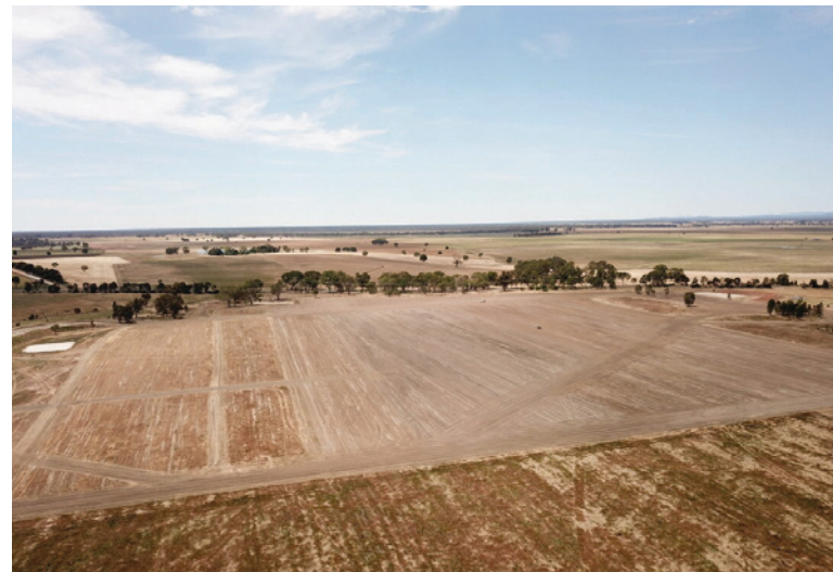
Aerial view of rehabilitated Douglas Pit 5

Over the upcoming drier months, activity on site will increase as we move to completing further areas and bring the site closer to full rehabilitation.