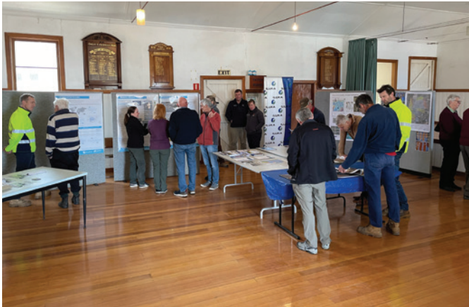
Iluka's third Community Information Session for the Wimmera Project at Noradjuha Hall

We hosted the third Community Information Session for the Wimmera Project on 25 October at the Noradjuha Hall. Over 30 community members and stakeholders came on the day, and were able to view new project materials and maps, engage with consultants on their studies, and get to know the Iluka team. Key topics that were covered included surface water management, groundwater and ecological impacts and opportunities, traffic and road impacts, bushfire risk and management, employment, and social impact. We enjoyed getting to know some of our local community members and engaging in many interesting conversations.