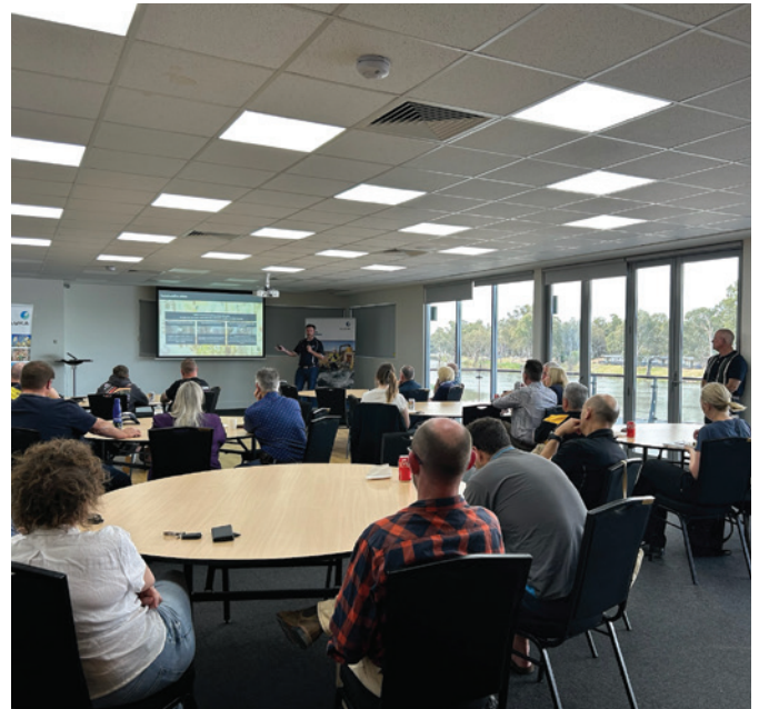
Iluka's second Community Information Session for the Euston Project at the Mildura Rowing Club

We encourage community members and stakeholders to complete the survey by scanning the QR code or contacting Angela Peace from AAP Consulting at angela.peace@aapconsulting.com.au or 0438 620 066.