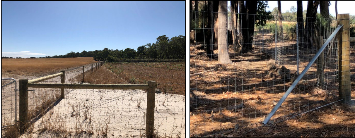
Plate 4: Internal Stock Fence (left) and 1.5m Boundary Fence (right)