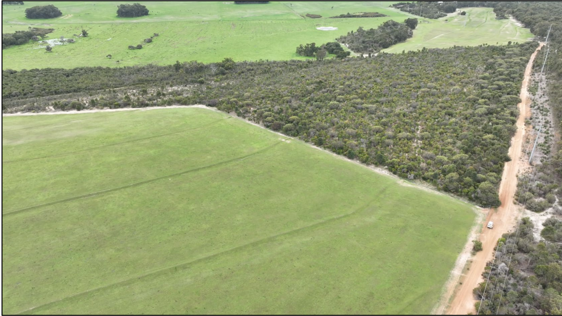
Plate 1: Roberts Block and Vegetation Link June 2023